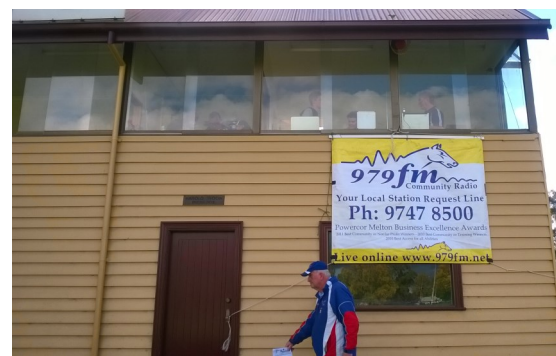
Game of the round from Ballarat