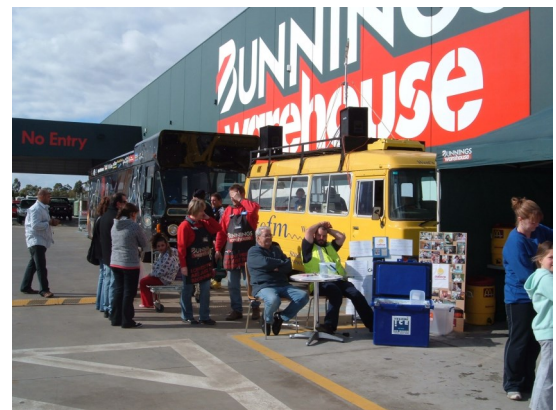
We support community BBQs at Bunnings

Should you need our help in promoting your activity, call us at 9747 8500 and leave all details of the event or send an email to advertise@979fm.com.au . Remember there will be a charge for all events which are not part of a Council or other charitable event..