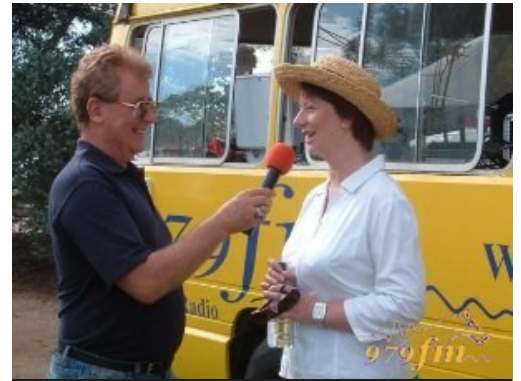
Important people seek us out