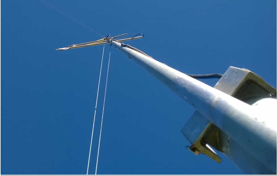
New dipole assembly restores our coverage