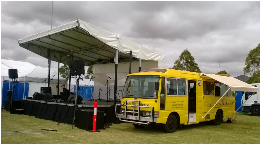
Setting up the OB bus for Summersault Festival at Caroline Springs