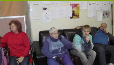
Members listening intently