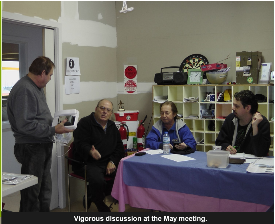
Vigorous discussion at the May meeting.

Monthly meetings provide a way to get to know presenters whom you never see because of the large number of program slots throughout the week.