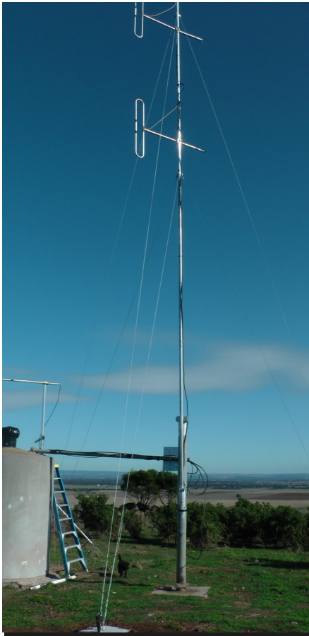
Reaching for the sky

Of course, this situation is also only temporary in order to restore coverage for those listeners who lost transmission when the storm hit and the mast fell over. With the help of a grant, we hope to erect a full size and higher tower which can accommodate, not only all of our transmission aerials and dishes, but can be offered to other companies requiring a transmission tower for their radio or message services.