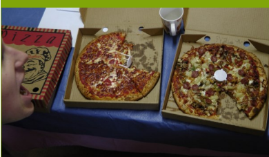
The main agenda item